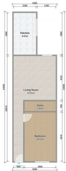
Pershore Road Ground Floor